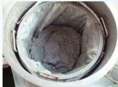
Grinded aluminum sludge after dehydration