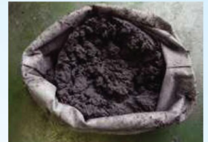
Grinded bearing steel sludge after dehydration

* State of sludge after dehydration depends on sludge and liquid type.